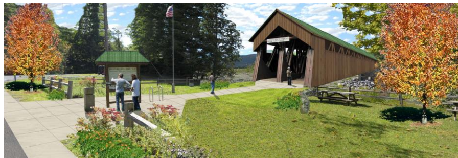
Artist rendering of restored, raised Blenheim Covered Bridge and Park