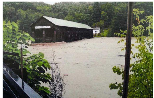
Bridge just prior to being washed downstream. 8/28/11